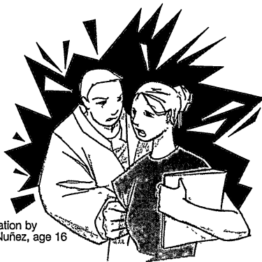
Illustration by Billy Nuñez, age 16